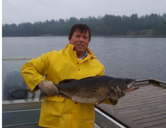
Gravid Moon River Spawner

6. Fish Population Monitoring and Assessment Program: The EGBSC conducted three fisheries assessment surveys in 2007: 1. Moon River walleye spawning index survey; 2. Harris Lake & South Magnetawan River walleye spawning index survey and the Bayfield-Nares Near-Shore Community Index Netting (NSCIN) survey. Walleye egg collection, culture and rehabilitative plantings were part of the first two surveys. Approximately 2 million walleye fry were planted.