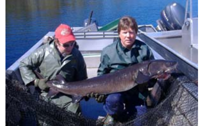
Sturgeon caught in Moon R. survey

7. Custodial Co-Management of Crown Land Campsites: This project to mitigate the deleterious environmental and social impacts of crown land camping was expanded in 2007. Fourteen partners (cottage associations, municipalities, environmental interest groups, GBBR and government agencies) participated in custodial activities that included signage, bush latrine installation and behind-the-scenes campsite cleanup.