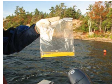
Lake trout eggs collected for Thiamine analysis

Egg samples were collected from 6 fish at the Davy Island site and 11 at Horse Island (Appendix A and C). At the time of writing of this report, analysis relating to thiamine levels was not available. This information will subsequently be posted on the website of the Great Lakes Science Centre ( www.glsc.usg.gov ) when available.