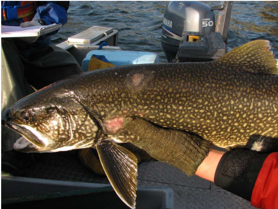
Evidence of recent lamprey attack but unsuccessful attachment