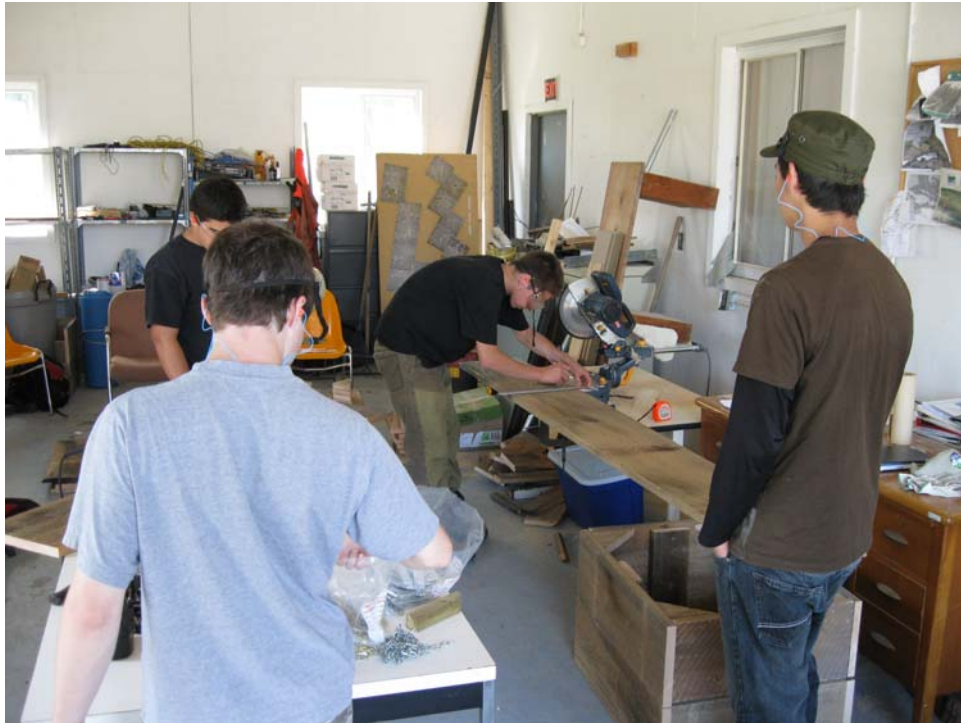
Thunder Box Construction