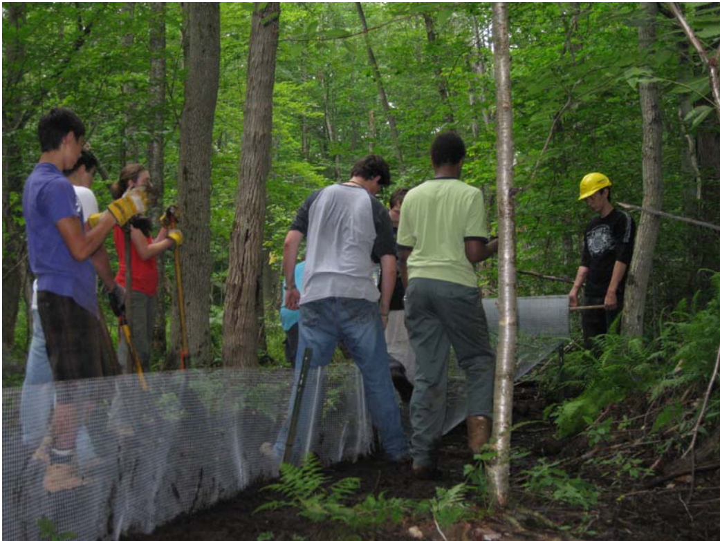
Snake Fence Work