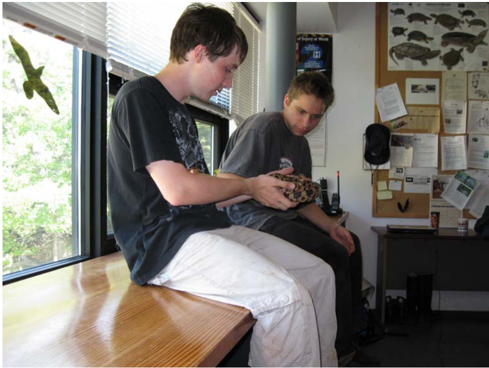
Introduction to Fox Snakes