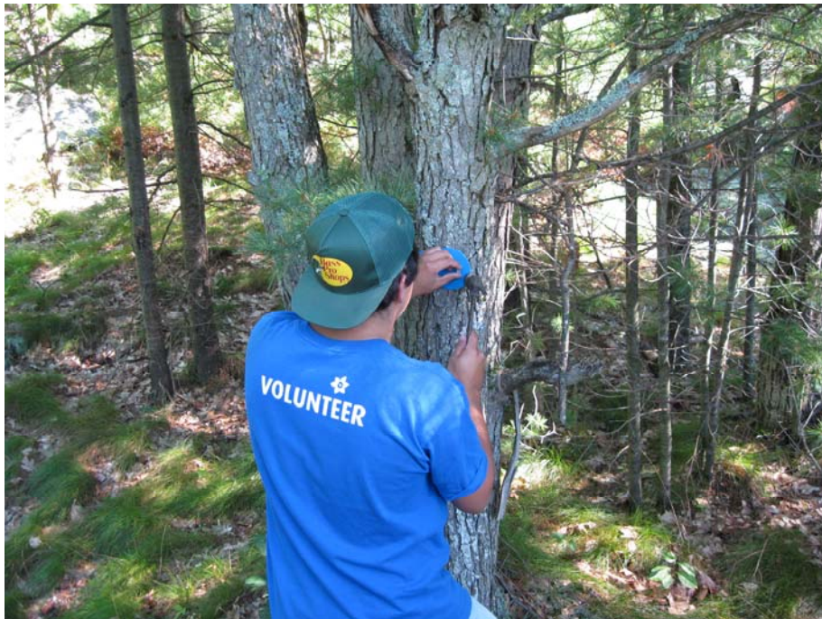
Trail Work at the Massasauga