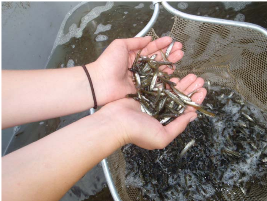
A sample of the 20,000+ walleye summer fingerlings stocked at Go Home Bay and Moon River in 2010.

The stocking of over 20,000 summer fingerlings to help rehabilitate walleye populations at Go Home Bay and Moon River was a milestone achievement by the Council in 2010. These plantings are part of a broader rehabilitation strategy that includes spawning habitat enhancement and population monitoring. Much of the credit for this walleye production goes to Cedar Brook Farms – a private hatchery near Victoria Harbour that raised the summer fingerlings under contract from the EGBSC. The source of the reared walleye was from the Moon River and Port Severn populations.