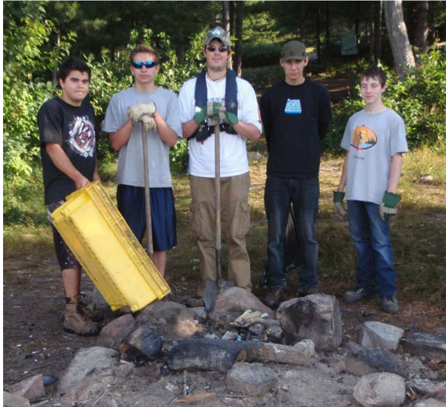
2010 Stewardship Ranger crew engaged in campsite clean-up activities in the Lower Moon River Conservation Reserve.

The EGBSC Ranger Crew enjoyed another fruitful summer of partnership work in 2010 including: the Rose Point Trail clean-up; assisting with the Georgian Bay Biosphere Reserve chimney swift survey; assisting the McKellar Conservation Association with spawning habitat enhancement; Crown land custodial work; constructing rattlesnake fences at Killbear Park; Kapikog trail maintenance; Parry Sound Anglers and Hunters safety fence construction; Aspen Valley Wildlife Centre maintenance and habitat work; and assisting the Georgian Bay Land Trust with clean-up of their Sandy Island property. Funding for this crew is provided under the Ministry of Natural Resources' Youth Initiatives and Ontario Stewardship Ranger Program.